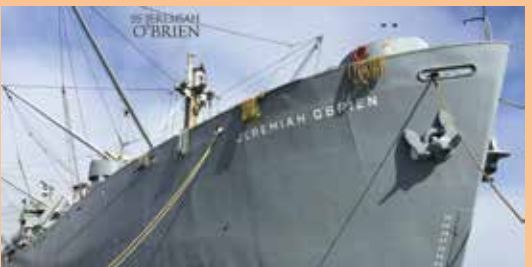
S.S. Jeremiah O'Brien Liberty Ship https://www.ssjeremiahobrien.org